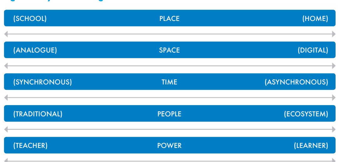
Figure 2. Hybrid learning variables

At the height of the COVID-19 pandemic, around 1.5 billion students were essentially evicted from their physical school grounds and forced to learn somewhere else. In addition, children who have long-term